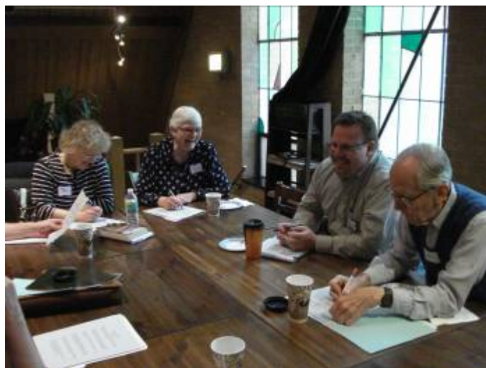
Members of St. Paul, Villa Park, discuss the dynamics of congregational renewal at the Turnaround 101 workshop in May.